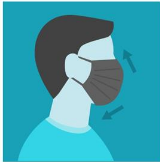
Figure A.1 – Accordion design

A.1 The following two images illustrate recommended designs for non-medical face masks made out of fabric. These images have been reproduced with permission from the University of the West Indies (St. Augustine Campus) from the document Product Specification COVID 19 PPE Project (CPP): Facemasks – 2020-04-06.